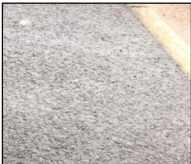
Shortly after treatment

As can be seen from the photos below, the new surface will be very dark in colour and coarse in texture, this is normal for this type of material, but its appearance will become more like you would expect over the following months following a period of 'bedding in'.